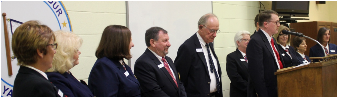
Installation of the Bridge and Board