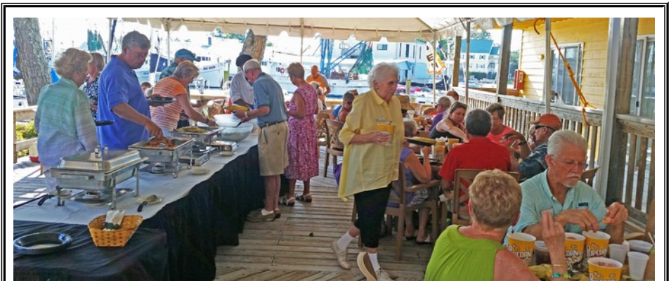
FHYC Members Enjoying the 2017 Shrimaroo!