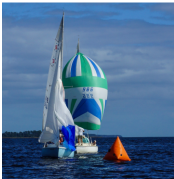
Ensign Racing

Save the Date... Commodores' Ball Coming March 15, 2018