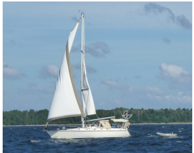
Feather Under Sail ...