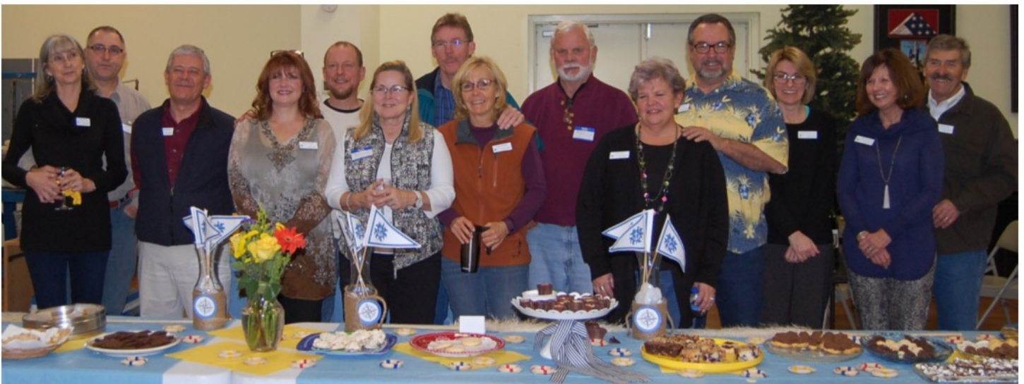
New members from 2017 get together to celebrate