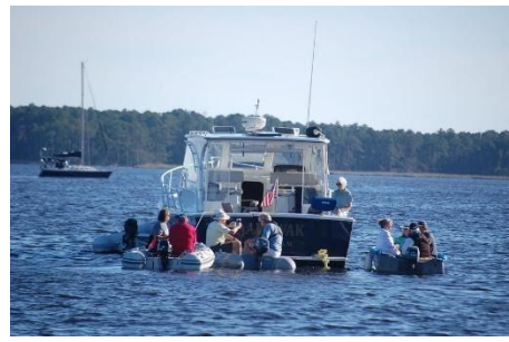
A beautiful sunset before the Harvest Moon.

BYOM&F affair (bring your own moonshine & food). Everybody had a good time and headed back their boats before the sun set.