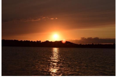
The Harvest moon is rising on the South River