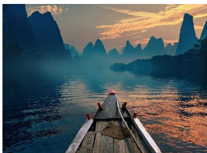
Sailing into the Sunset