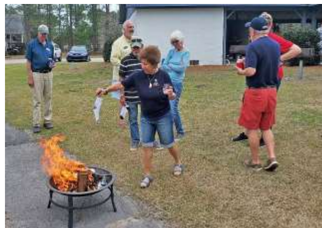
Some people show great finesse