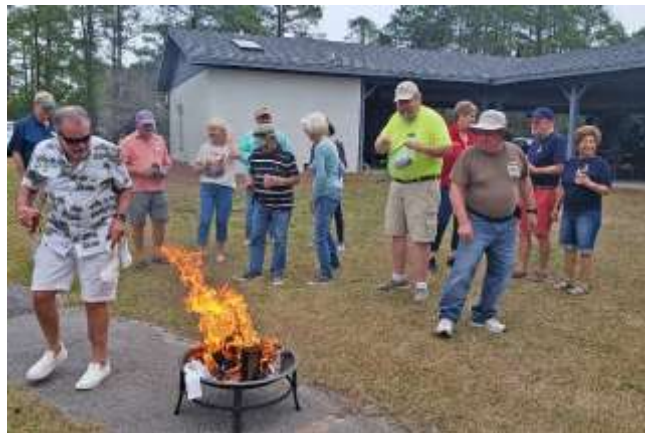
Some people sneak up on the fire

Original poem by Jefferson Holland, Eastport Adapted by FHYC