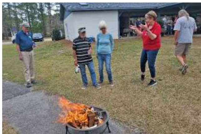
Some people do a happy fire dance