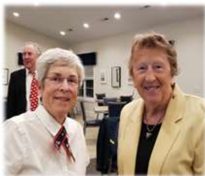
Past Commodores enjoyed a night out at the Harbour Pointe Grille.