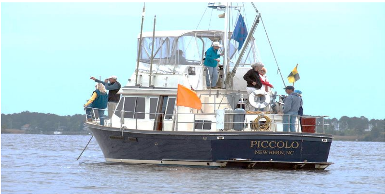
The Jarvises have enjoyed their Piccolos in many forms