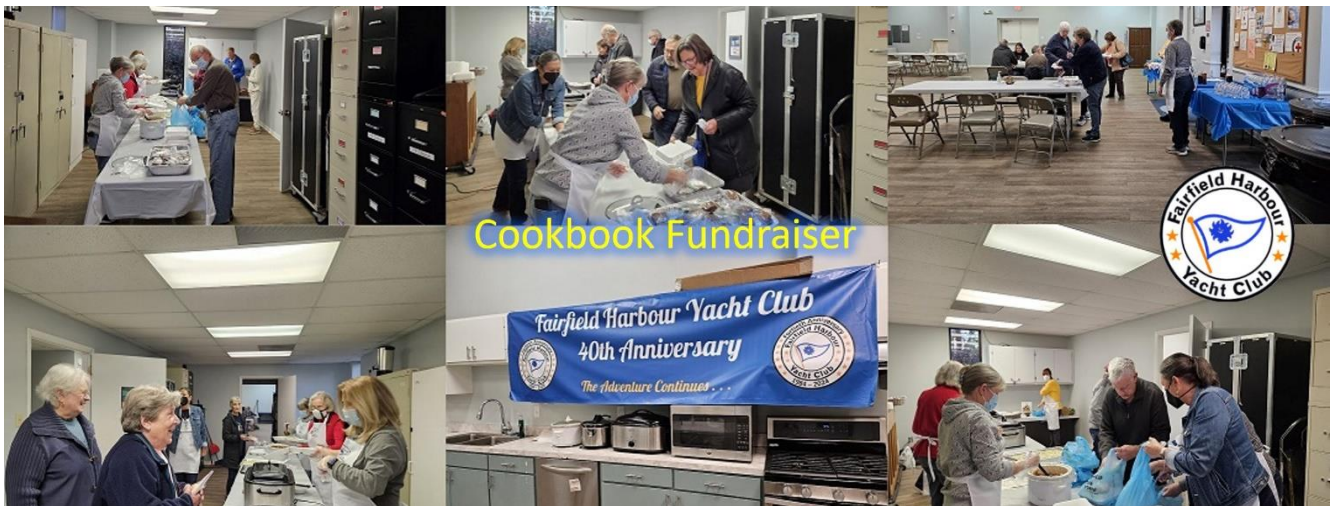
BBQ Dinner Photos

When the committee asked club members for recipes, they were surprised to receive over a hundred, which was narrowed down to 85 for the final printing. Everyone who submitted recipes had at least one published. The cook who submitted the recipe “staged” and photographed a picture of the finished product and wrote a short story about why this was a favorite recipe. Before the book could be sent to the publisher, the recipes had to be formatted all the same, which was a big task. Each committee member was responsible for editing one category and working with the contributor. The mouthwatering categories are Breakfast and Brunch, Appetizers and Hors d’oeuvres, Salads, Soups, and Breads, Entrées, Sauces and Condiments, Sweets and Desserts, and Cocktails.