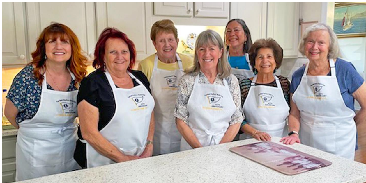
The Committee from Left to Right