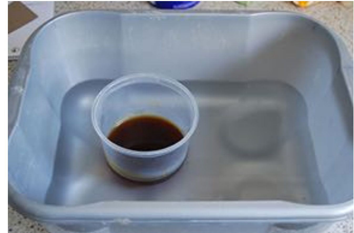
Warming Varnish in warm water bath improves Brush ability and leveling of coating