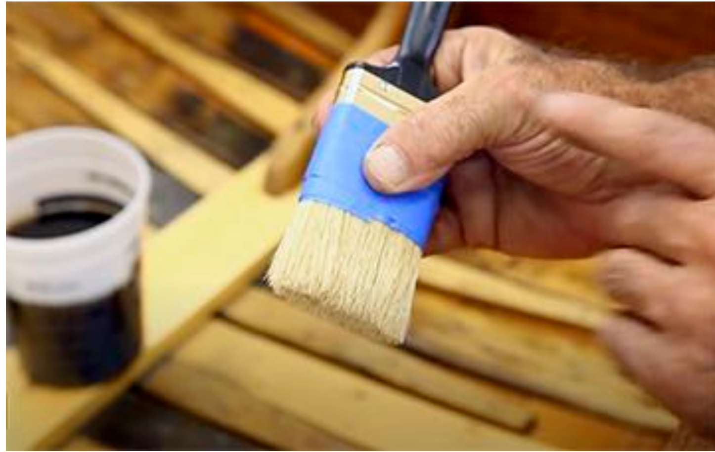
Adding masking tape to shorten brush bristle Length improves ability to spread thicker varnishes