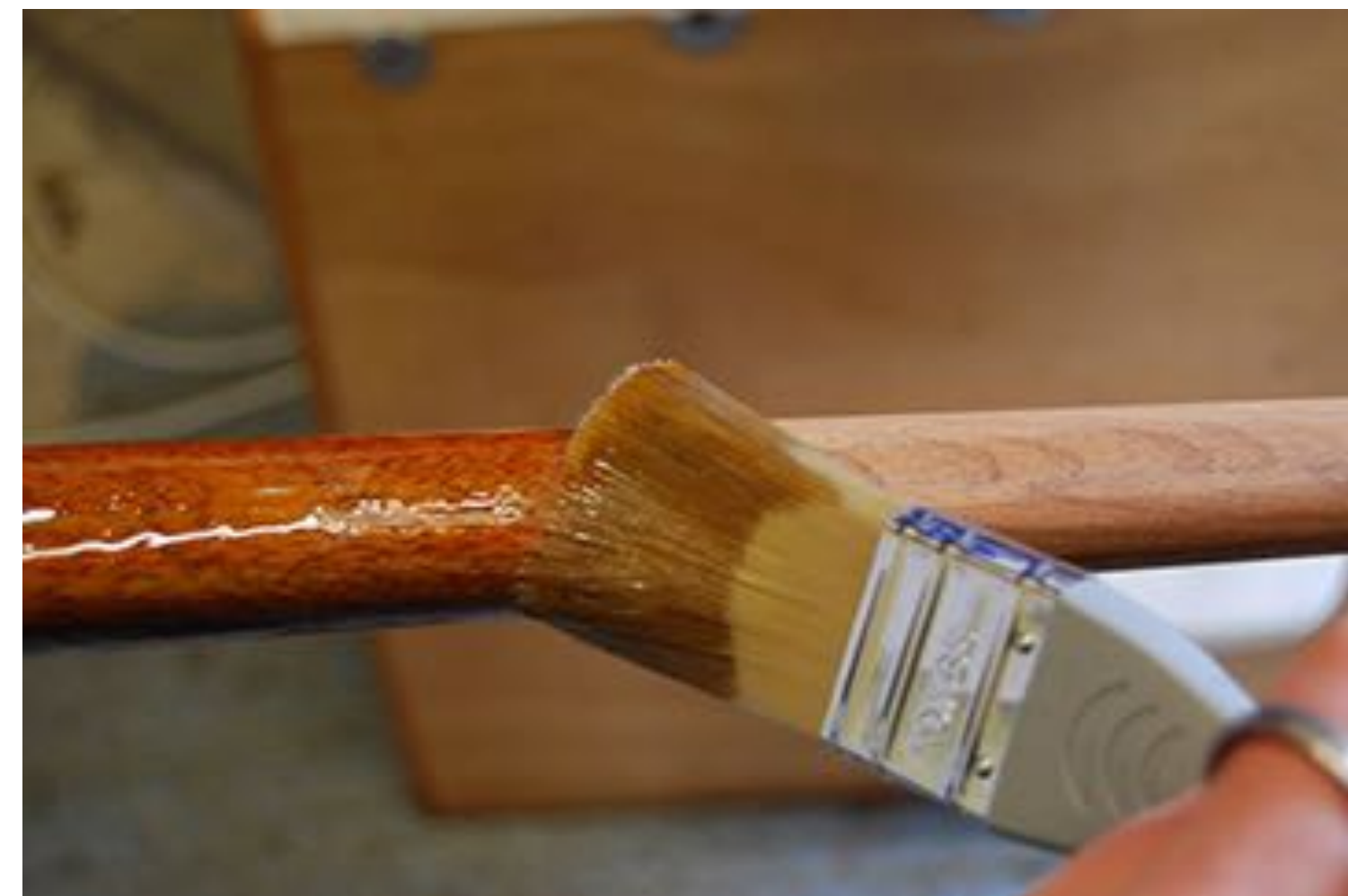
Using a brush sized for the part being varnished