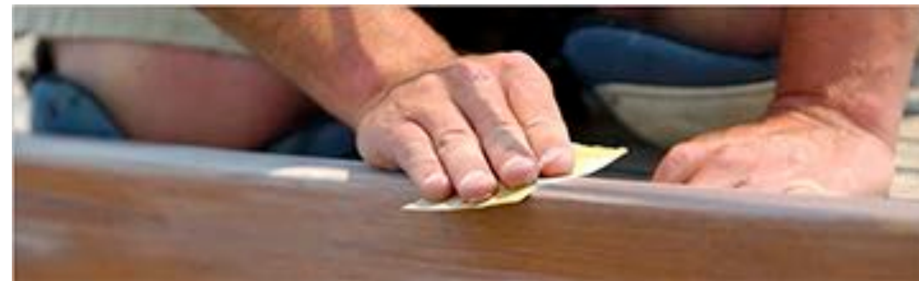
Hand sanding narrow surfaces and hard to reach areas