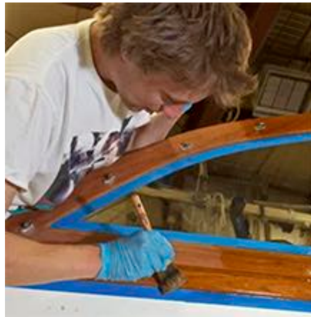
Taping off adjacent surfaces to restrict varnish coverage makes clean up easier