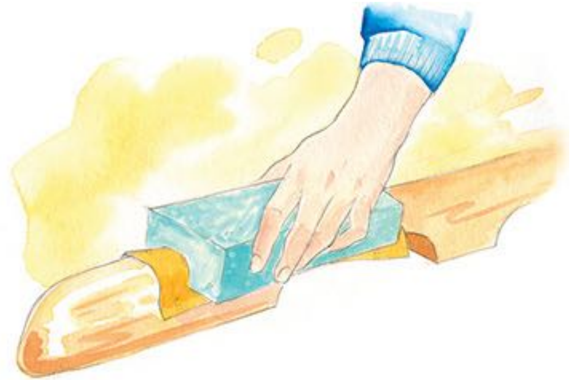
Shaped foam block for sanding contours