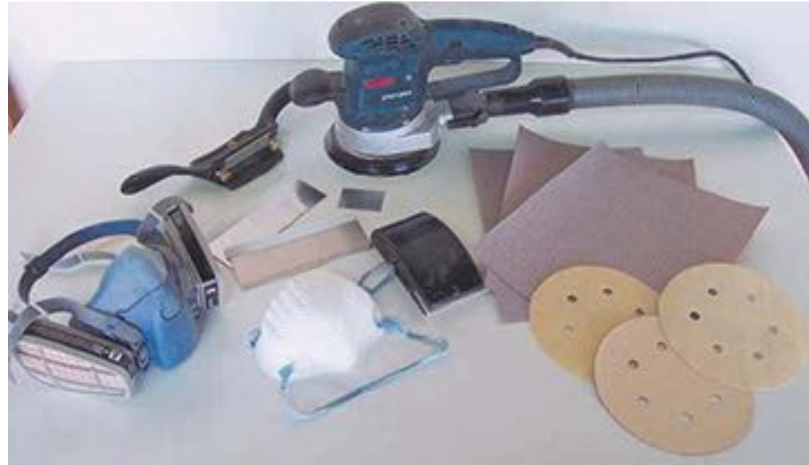
Power Sanding equipment and materials